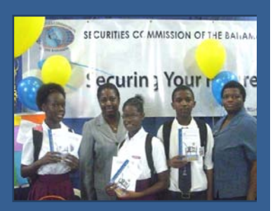
Commission staff and students at the Ministry of Education's Careers Fest